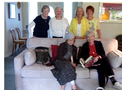
Above: some of our members